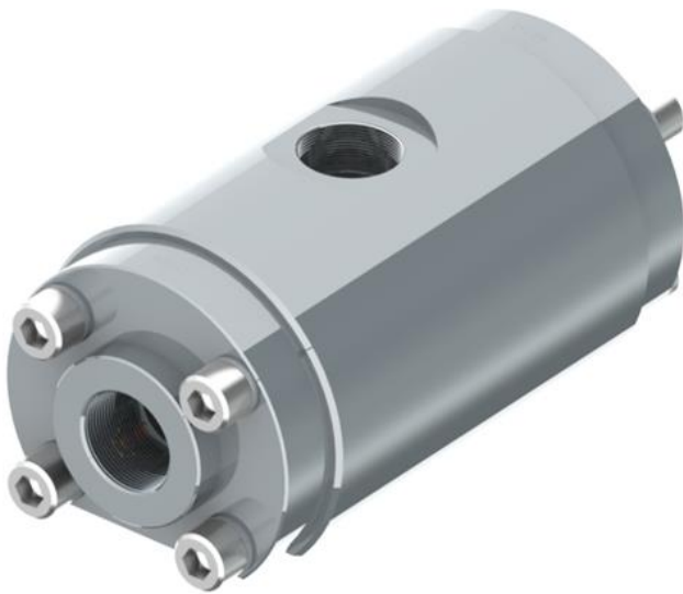
Figure 1. PN 29042: 1" NPT GEN 2 V-Seal Shuttle Valve, 5000 psi, Low interflow