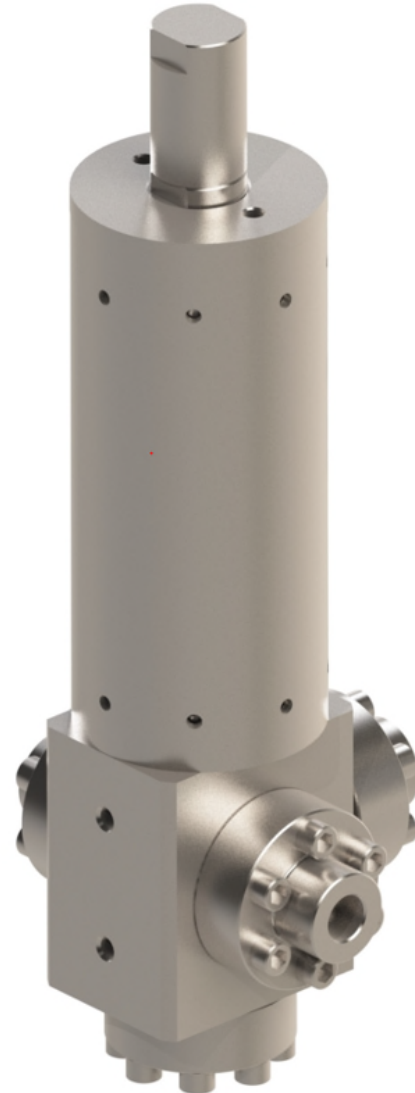
Figure 1 PN 29197: 1/2" GEN2 Pressure Regulator, 10 ksi, Manual Spring, 9/16" MP ports, 8000 – 4000 psi range