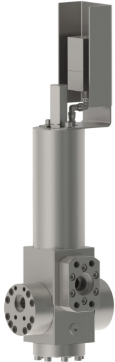
Figure 1. PN 29094: 1" Gen 2 Pressure Regulator, Manual Spring, Double Inlet, Code 62, 4500 – 2000 psi with Optional Pressure Compensator