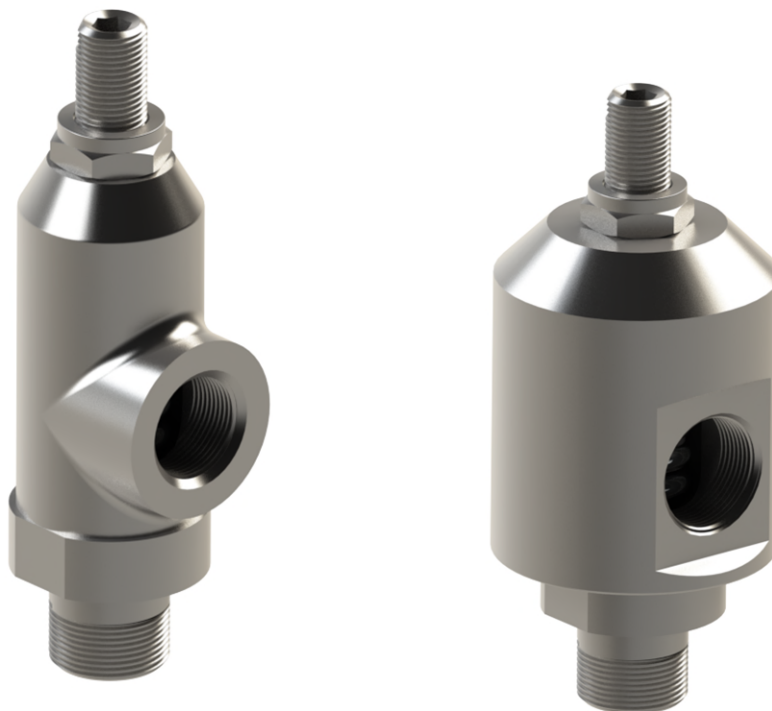
Figure 1. PN 25320-1 with obsolete cast bonnet PN 23401-2 (Left) and new machined bonnet PN 23401-3 (Right)

PN 25320-1, PN 25320-2, PN 25320-3, PN 25320-4, PN 25320-5 PN 25323-1, PN 25323-2, PN 25323-3, PN 25323-4, PN 25323-5