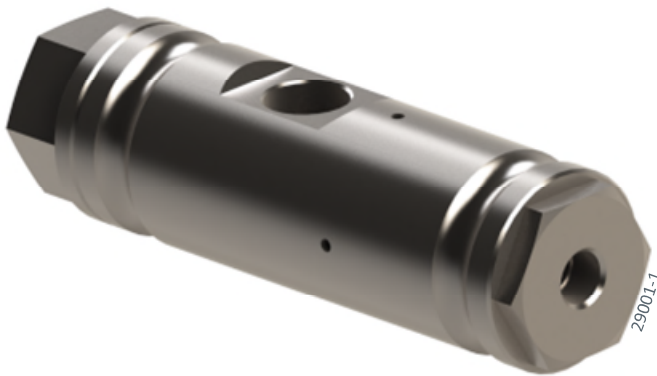
Figure 1 and 2. PN 29001-1: ½" NPT Pilot Operated Check Valve, External Vent and Cross-section